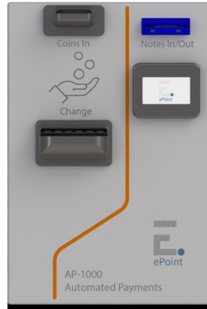
Quad Note Recycler